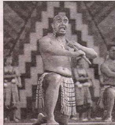
MAORI RITUAL: A traditional Haka dance