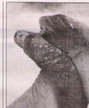
WILDLIFE: Seals can be seen in Otago

The venue for Wales' pivotal opening match against 2007 champions South Africa,