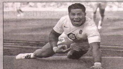
BOX OFFICE: England's Manu Tuilagi is set to star in NZ